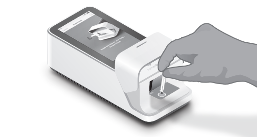
Sample application using a transfer tube

You may use a non-anticoagulated Transfer Tube to transfer the capillary sample from the finger stick to the Sample Application Area of the Test Strip. To do this follow the procedure above for collecting a capillary blood sample from a finger stick. Use the Transfer Tube by placing it into the blood droplet on the finger, and the blood should quickly move into the tube. Then hold the Transfer Tube over the Sample Application Area of the Test Strip and dispense the sample. This should be enough just to fill the Sample Application Area. Take care not to introduce air bubbles into the sample. When the sample is detected the Instrument will sound (if sounds are enabled) and a confirmation message will be displayed. The touch-screen of the LumiraDx Instrument will request the user to close the door. Dispose of the Transfer Tube in the appropriate clinical waste. Follow instructions from step 4.